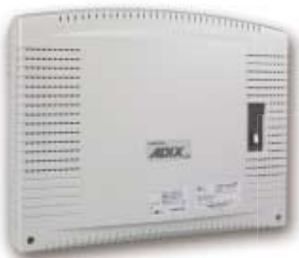
ADIX-VS Cabinet (VS-KSU)

With screen pops, you can maximize overall quality and efficiency in call handling and customer service. When a call rings into your station, the Caller ID information can also be sent to your TAPI-compliant computer application, which will display the calling customer's database on your PC screen for your convenience while on the call. Automatic accessibility to your calling customer's database provides you with the pertinent information necessary to effectively and seamlessly manage their specific needs.